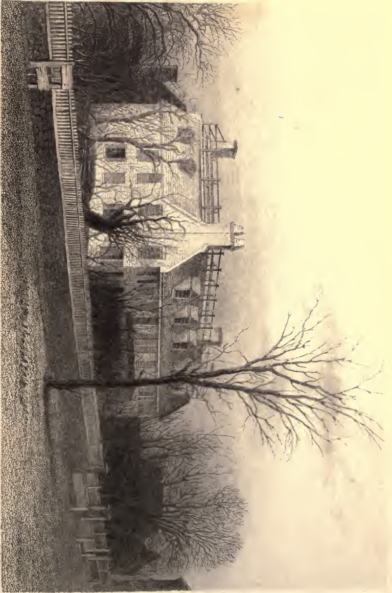
View of the building from the west side.